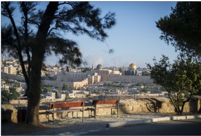
One of the most breathtaking views of Jerusalem