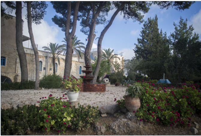
A beautiful spot, conducive toward meditation