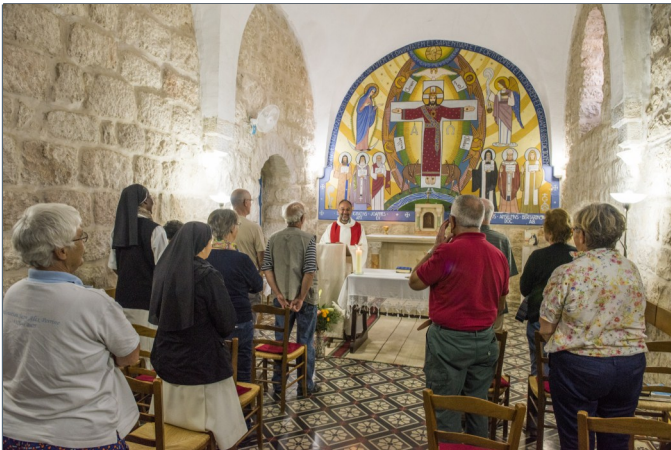
A place of worship and celebration