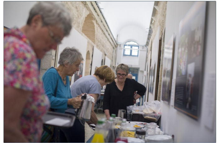
A devoted team, comprising many volunteers