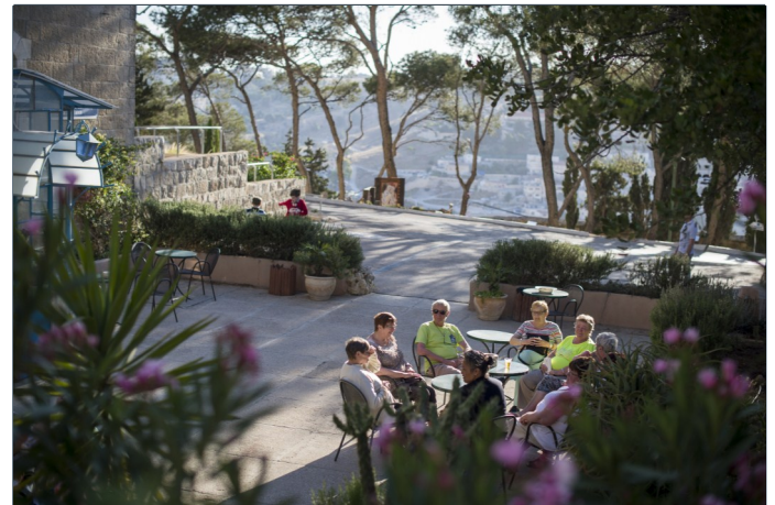
A place of personal exchange and togetherness