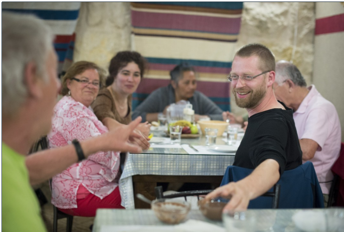
A family atmosphere